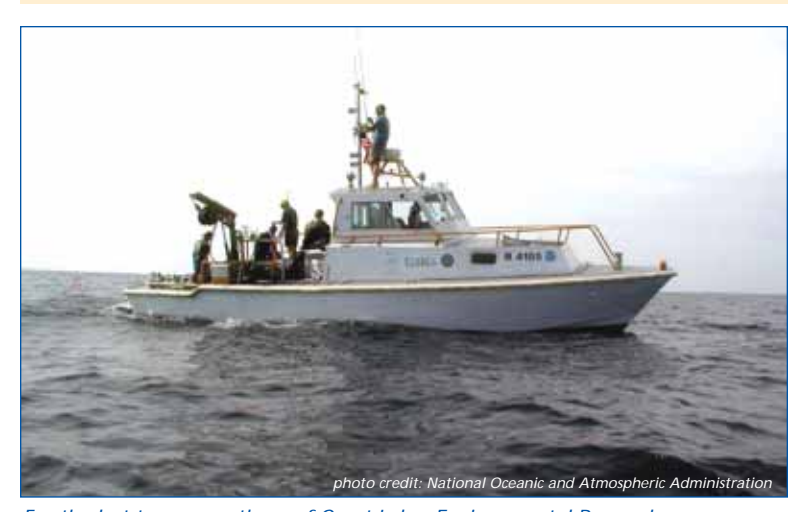
For the last two years, three of Great Lakes Environmental Research Laboratory's diesel ships run completely on biobased (rather than petroleum-based) products. Their efforts have garnered honors from the U.S. Department of Energy Federal Energy Management Program.

These products are made by Renewable Lubricants www.renewablelube.com.